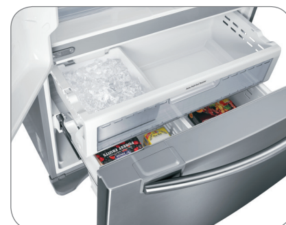
Automatic Filtered Ice Maker in the Freezer