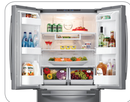
French Door Design