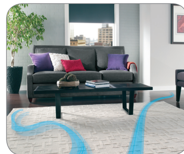
Motion Sync Design™