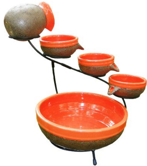
Tangerine and Rustic Brown Finish