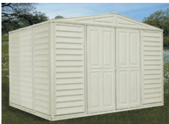
10.5' x 8'