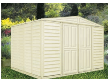
10.5' x 10'