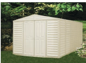
10.5' x 13'