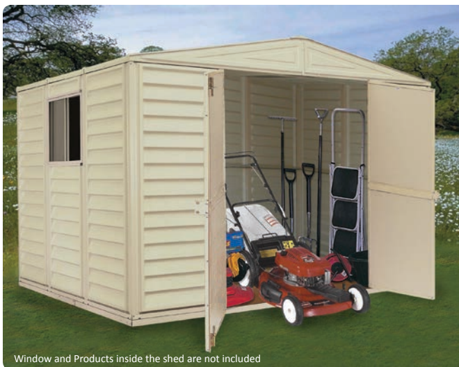
Window and Products inside the shed are not included