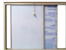
Window Kit (08211)