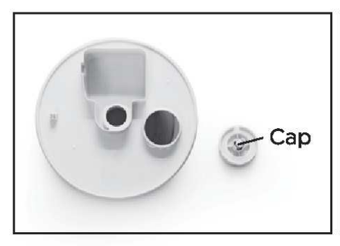
Bottom View of Water Tank