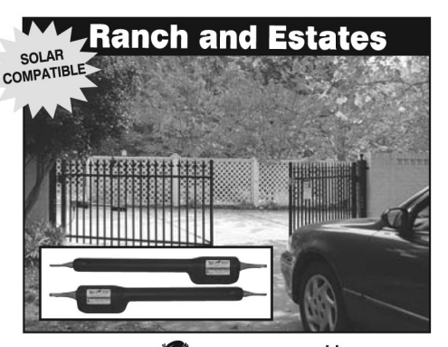
MIGHTY 502 E-Z GATE OPENERS