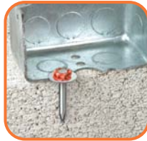
Steel to Concrete