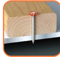
Wood to Steel