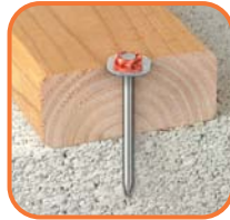
Wood to Concrete