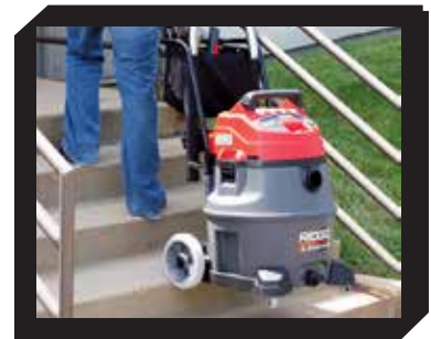
Great Mobility - Steps & Rough Terrain