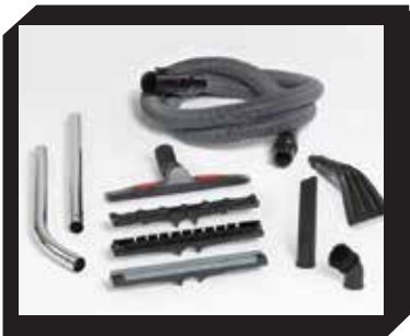
Heavy Duty Accessories