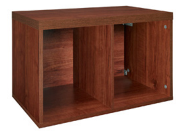
ShelfTrack Elite 2-Cube Kit Organizer