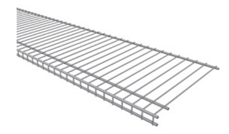
SuperSlide 6 ft. W x 12 in. D Wire Shelf