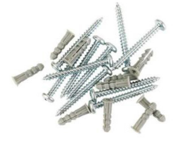
ShelfTrack Mounting Hardware (10 Pack)