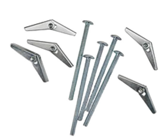
ShelfTrack Wall Anchors (5 Pack)