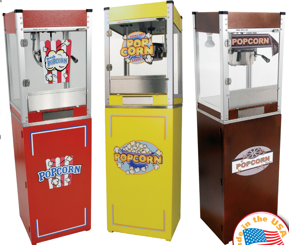
Comes in 3 colors and styles. Choose between Red, Yellow or Antique Copper.