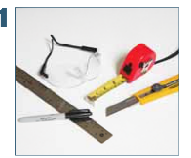
Tools Required: Straight edge, utility knife, tape measure and safety goggles