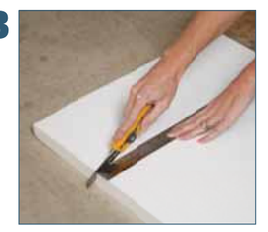
Cut each insulation sheet to length.