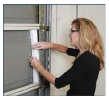
Insert the excess insulation behind the vertical rails.