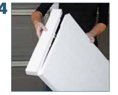
Break off the insulation where cut.