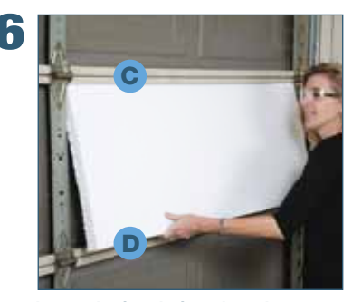
Insert the insulation sheet between horizontal rails C and D with the channeled or grooved side facing the garage door.