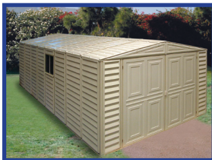
10.5' x 23'