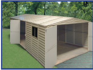
10.5' x 18'