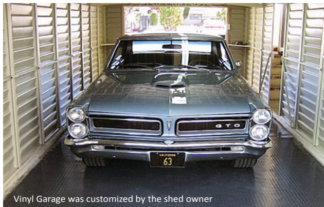
Vinyl Garage was customized by the shed owner