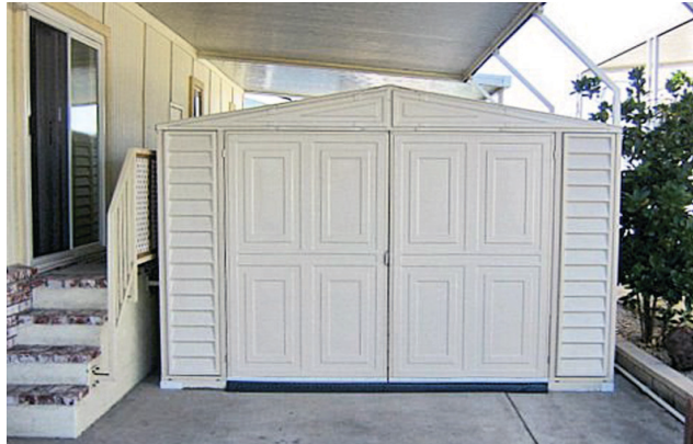
Perfect for Tight Space