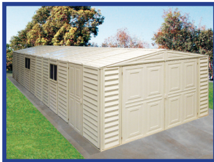
10.5' x 21'