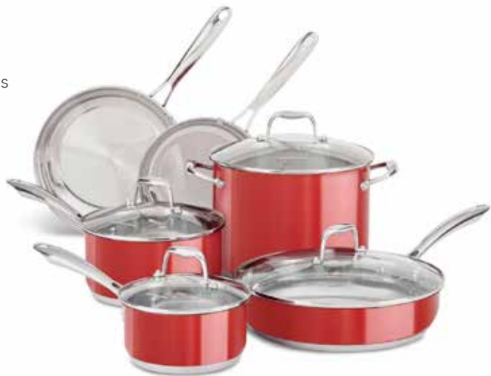
10-PIECE SET SHOWN | EMPIRE RED