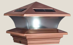
Solar Summit Copper 4x4