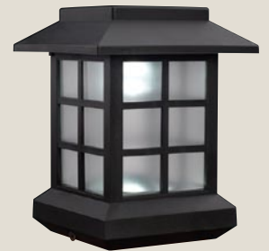
Solar Cottage Black 4x4