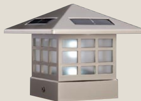
Solar Bungalow Stainless 4x4