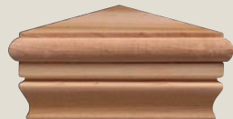
High Pyramid 4x4