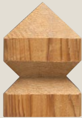
Suburban Pyramid 4x4