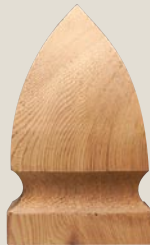
Colonial Acorn 4x4