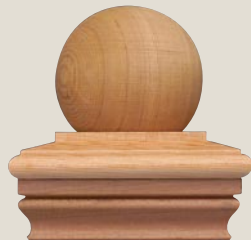
Ball Cap 4x4