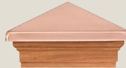
Copper High Point 4x4 / 6x6