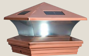
Solar Summit Copper 6x6