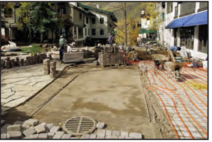
Snow Melt Installation