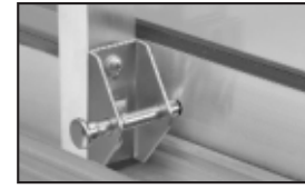
EDGE OF FIXED DOOR (OUTSIDE SLIDING DOOR)