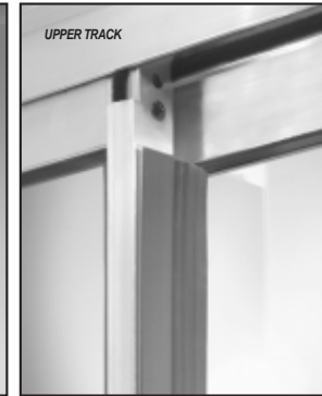
FIG. 4 - DRAFT•STOPPER™