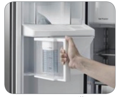
Auto Water Fill