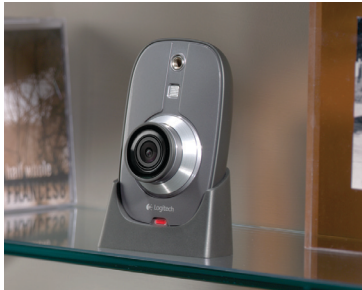
On a desk or table

Place your camera almost anywhere using the included desktop stand, wall mount, or suction cup—attached to a window, pointed inside or out.