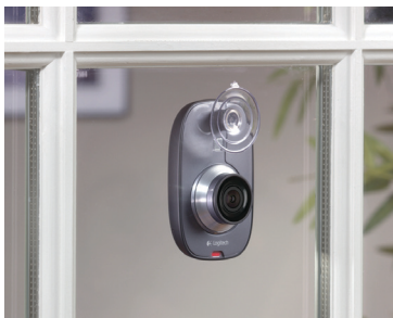
On a window looking out