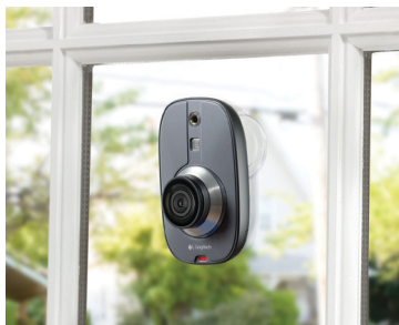
On a window looking in