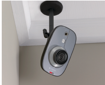
On a ceiling