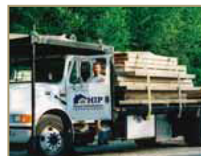
Truck arrives with prefabricated shed sections