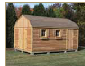
Most sheds are complete in 2 to 4 hours!