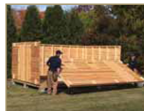
Wall sections are positioned and nailed into place