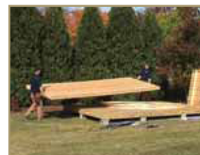
Sections are carried to site and floor is leveled on concrete blocks