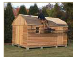
Roof shingles are applied