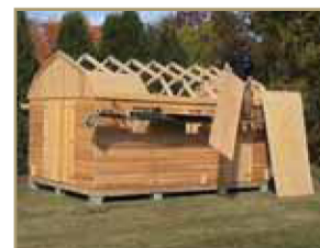
Roof trusses and sheathing is installed