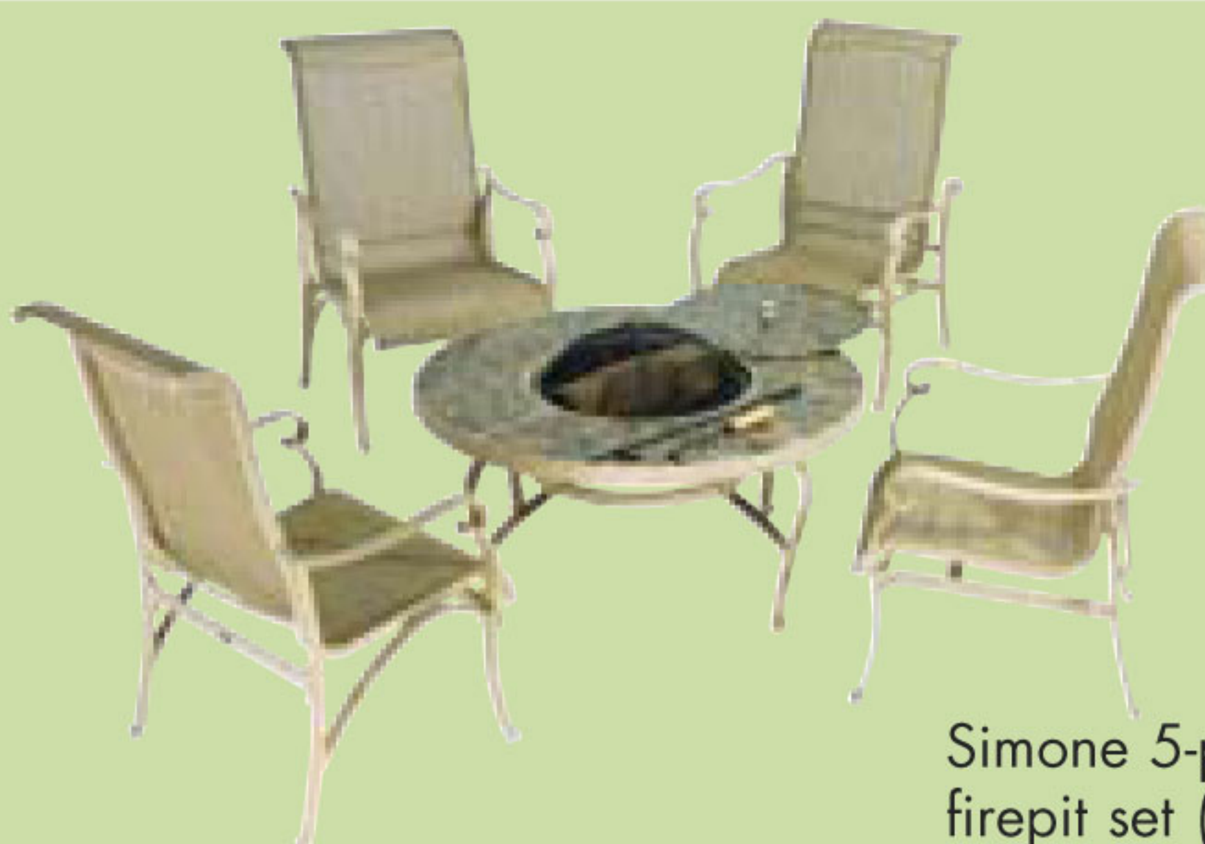
Simone 5-piece firepit set (746914)

Don't want to build it yourself? Cozy up to Hampton Bay®'s Simone 5-Piece Firepit Set. Copper bowl set in an inlaid marble table houses a wood-burning fire or ice and drinks. Includes four contoured chairs.