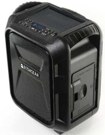
EcoBoulder Speaker Model# GDI-EXBM900 Series

If you still have EcoBoulder Bluetooth Speaker Model GDI-EXBM900 Series unit, please immediately stop using the unit and call the number below.